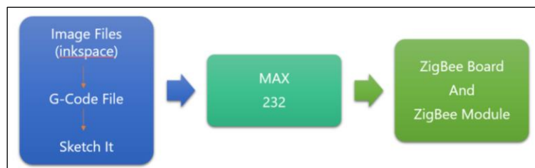
Figure 1 - Block diagram of the transmitting side of the mini CNC plotter

d. Telemetry Transceiver Interfacing : Because commercial computer terminals lack built-in low-power radios, a transceiver interface bridge (such as a MAX232 logic level shifter or an integrated USB-to-UART converter) matches the computer's serial outputs with an external Zigbee transmission module.